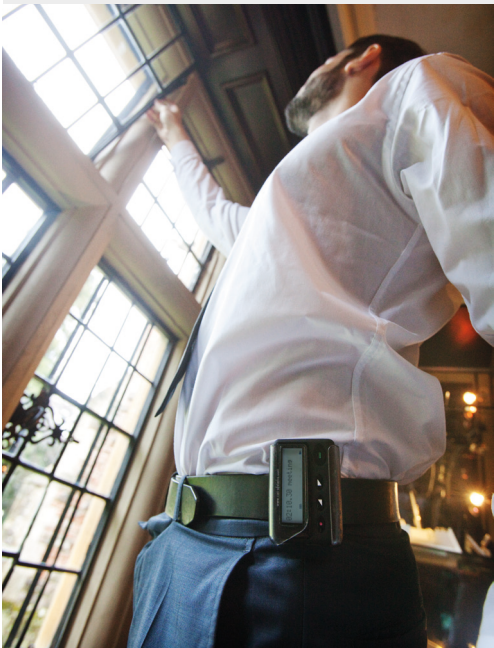
Staff recieve alphanumeric messages via the staff pager

EasyCall is a low cost paging system that demonstrates its return on investment as soon as you begin using it. Using EasyCall shows your organisation cares about the quality of customer service you provide.